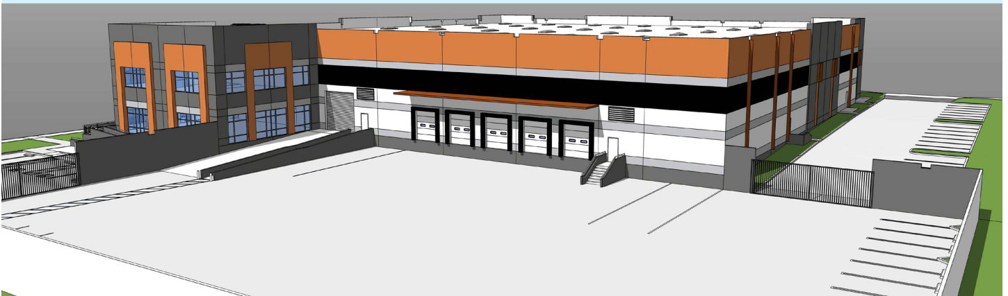
Aerial View NE @ Street Corner