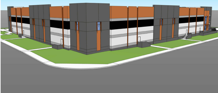
Aerial View NE @ Street Corner